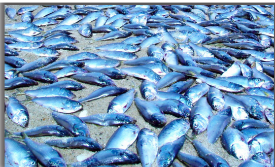
Severe hypoxia in Greenwich Bay, RI, killed more than one million fish in August 2003.