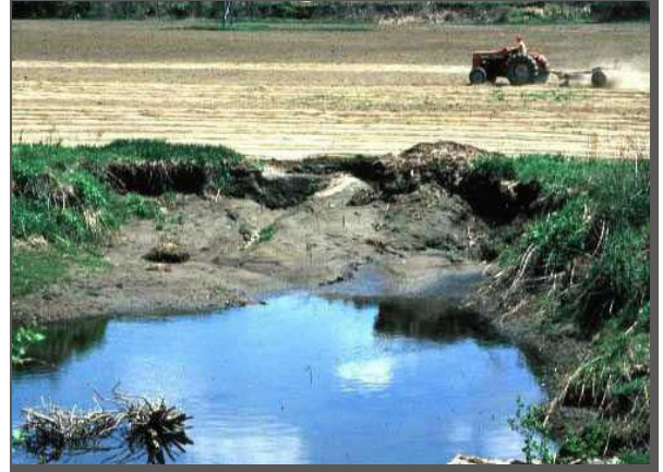
Agricultural runoff contributes to HAB and hypoxic events