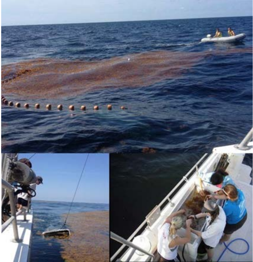
Figure 2. Plankton purse seine. Top: encircling Sargassum with a plankton purse seine; Bottom Left: collecting Sargassum with a neuston net; Bottom Right: Rinsing Sargassum in sorting trough.

<u>Sabiki rigs</u> - Opportunistic hook-and-line sampling with Sabiki rigs may be used to collect larger, mobile juvenile fishes associated with Sargassum and in open water habitats ( i.e. , carangids). However, Sabiki rigs were not successful in open water during the first cruise and may or may not be used in open water during future cruises.